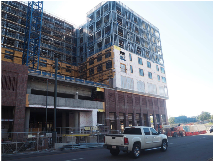
An apartment building under construction in the 3700 block of Downing St. on Oct. 1, 2023.

📁 POSTED IN » Commercial Real Estate ( https://businessden.com/category/commercial-real-estate/ )