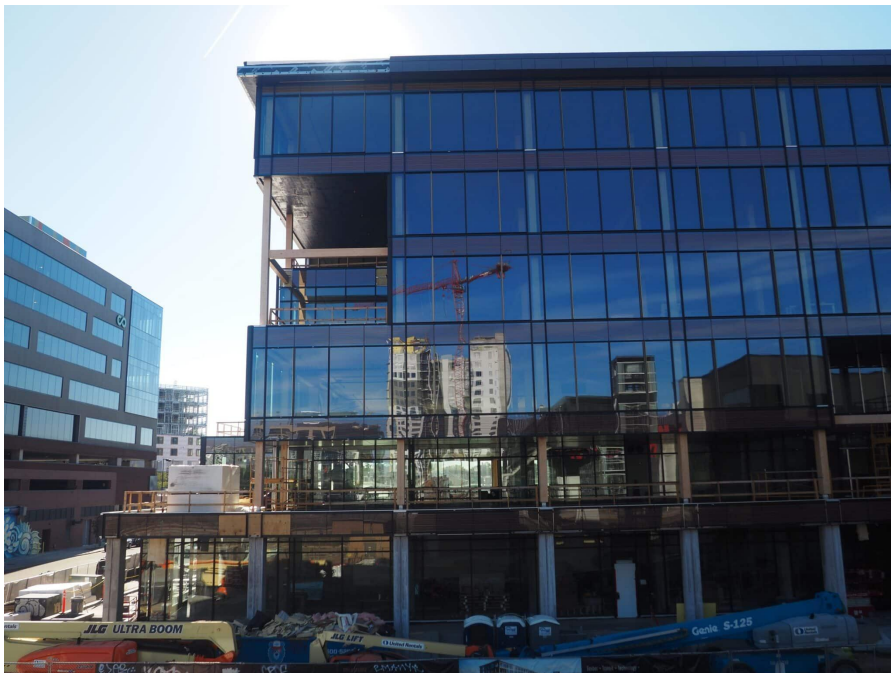
The T3 office building at 3500 Blake St. as seen from a nearby pedestrian bridge on Oct. 1, 2023.

One River North, 3930 Blake St.: This eye-catching apartment building is being developed by The Max Collaborative, Uplands Real Estate Partners, Wynne Yasmer Real Estate and Zakhem Real Estate Group.