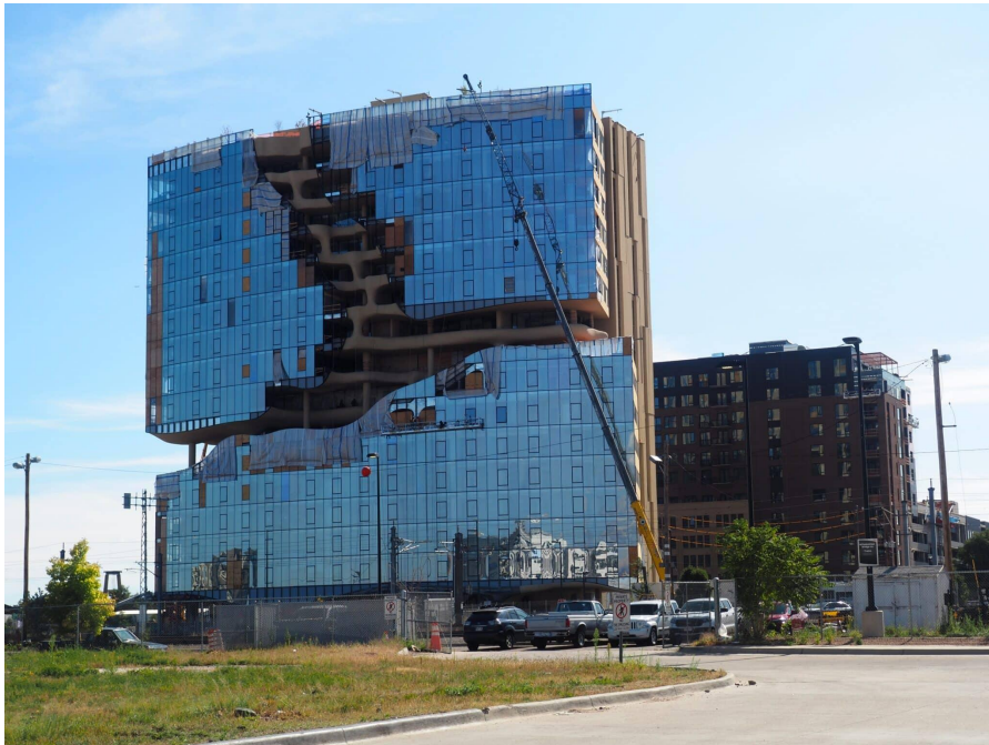
One River North as seen from the RTD parking lot on Oct. 4, 2023.

Apartment project, 3720 Downing St.: This eight-story building is being developed by Houston-based Transwestern.