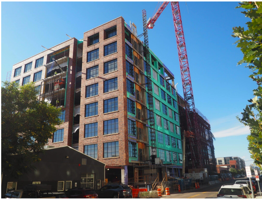
The Paradigm River North building on Oct. 1, 2023.