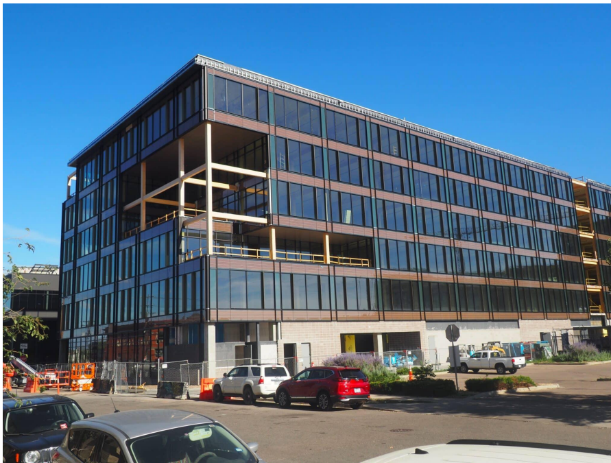
The T3 office building as seen from 35th Street on Oct. 1, 2023.