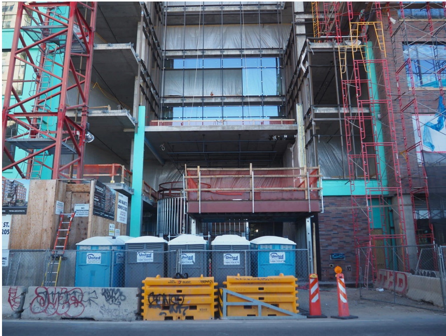
The base of the Paradigm River North building on Oct. 1, 2023.

T3, 3500 Blake St.: A block away, Houston-based Hines, Chicago-based McCaffery and Canadian investment firm Ivanhoe Cambridge are building a six-story office building dubbed T3.